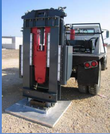
Compatible with Most Seismic Sources