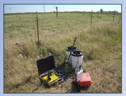
Small Scale Hammer

In integrated mode, the observer controls the acquisition process, organizing multiple source units and monitoring their production. In autonomous mode, without any radio communications, each source drop operates in its "Time Slot". These are allocated in advance to prevent multiple sources from starting at the same time. Then, all of the source information is saved on a non-volatile CF card for later download and analysis.