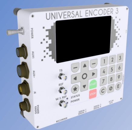
Recommended for use with SSC's Universal Encoder 3