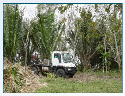
Large Scale AWD