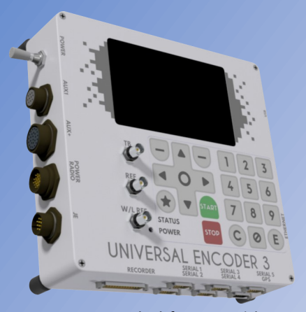
Recommended for use with SSC's Universal Encoder 3