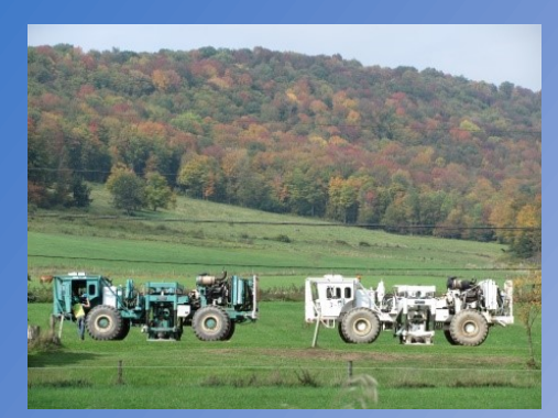
Compatible with P-Wave and Shear-wave Vibrators