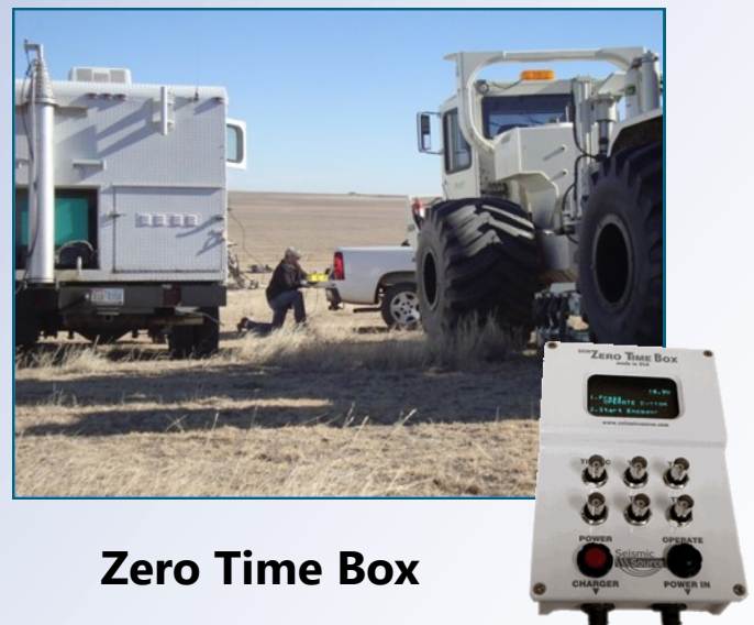
Zero Time Box