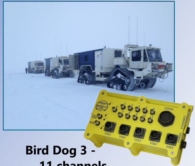
Bird Dog 3 - 11 channels