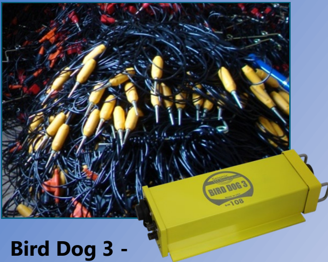
Bird Dog 3 - 3 channels