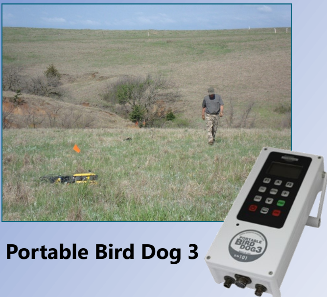
Portable Bird Dog 3