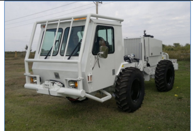
Individual Small Vibrators

When paired with Force III vibrator decoders or Boom Box III dynamite blasters, UE-II encoders use an intelligent, highly adaptive