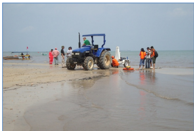
AWDs, EWGs & Sledgehammers