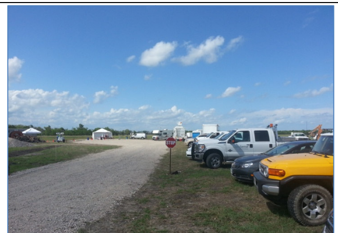
Multiple Recording Systems