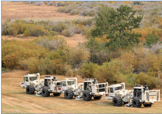
Fleets of Large Vibrators